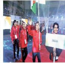
Flag-bearer, Mary Kom and the team at the World women's boxing championships opening ceremony.