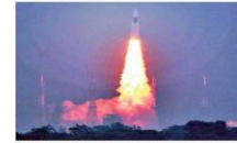
The GSLV-MkIII D2 lifting off from Sriharikota on Wednesday.

The team went ahead with the launch of the GSAT-29 on board its second developmental flight GSLV-MkIII D2 from the Satish Dhawan Space Centre at Sriharikota to clear blue skies as plumes of smoke from the rocket left a trail in the horizon after lift-off