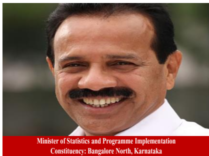
Minister of Statistics and Programme Implementation Constituency: Bangalore North, Karnataka

डी. वी. सदानंद गोड़ा ने रसायन और उर्वरक मंत्रालय का कार्यभार ग्रहण किया है।