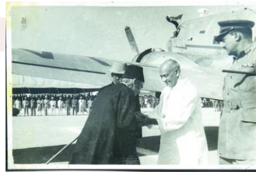
Nawab Mir Osman Ali Khan welcoming Sardar Patel at Airport in 1949. Major General J.N. Chowdhri is on right side.