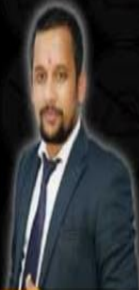
5:30 PM Rajeev Mahendras GENERAL AWARENESS