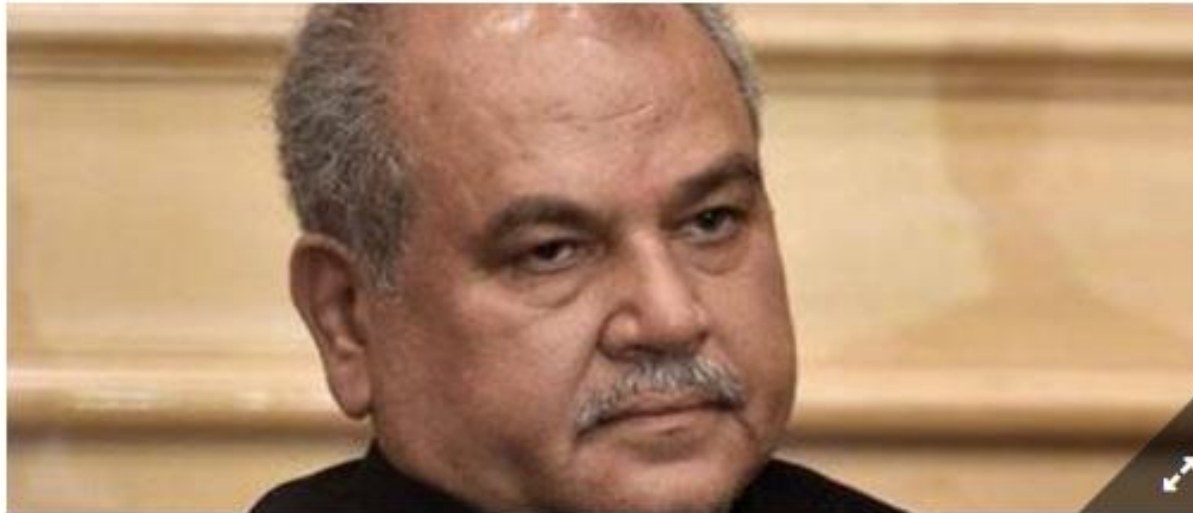
Union Agriculture Minister Narendra Singh Tomar

Our Bureau | Ahmedabad | Updated on July 24, 2020 | Published on July 24, 2020