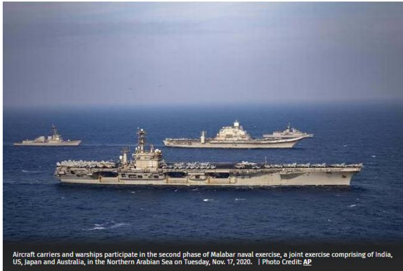
Aircraft carriers and warships participate in the second phase of Malabar naval exercise, a joint exercise comprising of India, US, Japan and Australia, in the Northern Arabian Sea on Tuesday, Nov. 17, 2020.