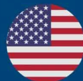
United States of America